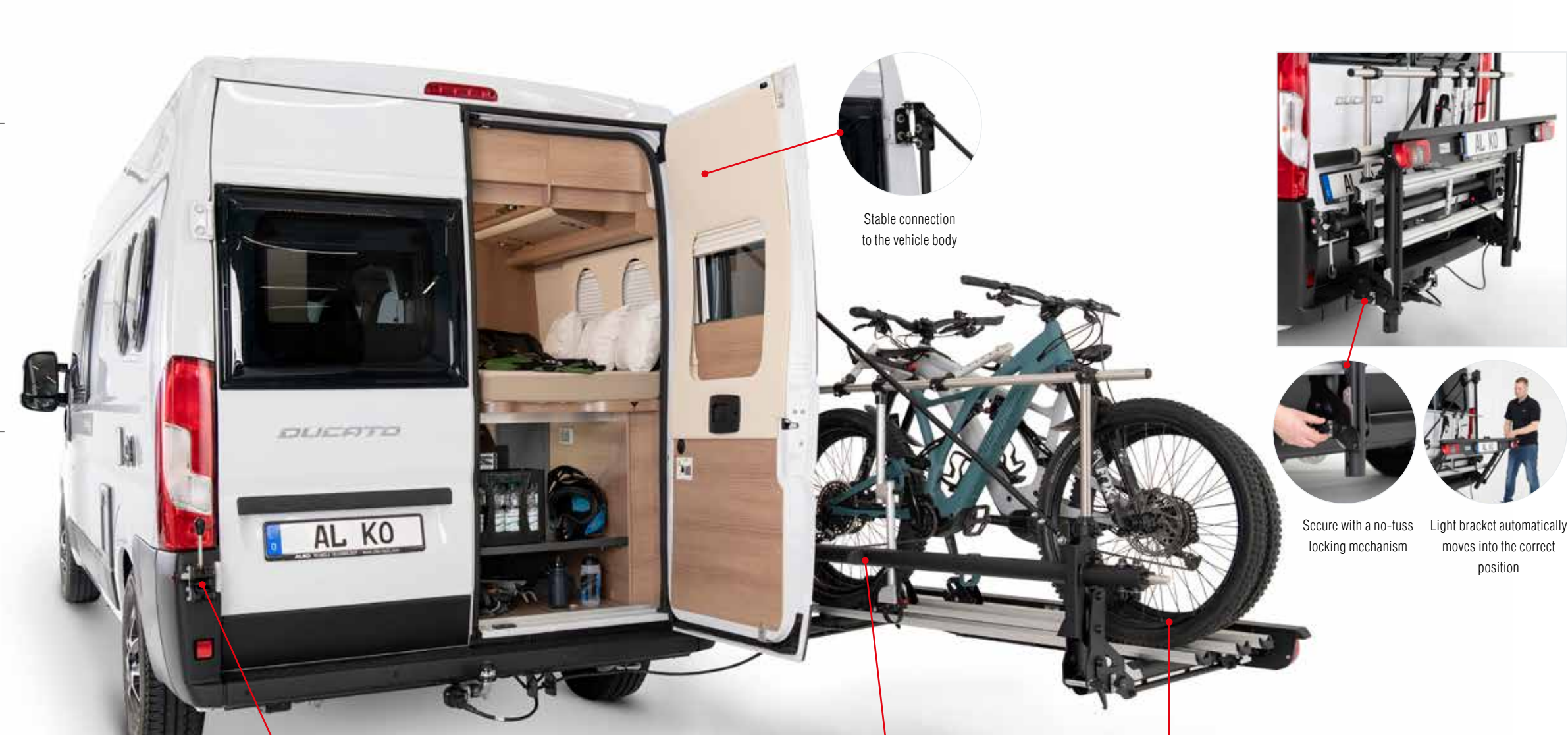
Conversion kit for 3 e-bikes or bicycles