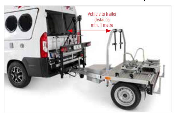
Towbar can be used without any restriction